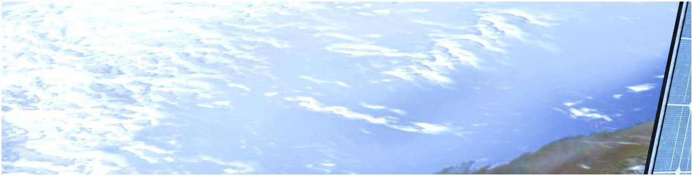
Starlab, a commercial low-Earth orbit space station is being planned for use by 2027

Nanoracks, in collaboration with Voyager Space and Lockheed Martin [NYSE: LMT], has formed a team to develop the first-ever free flying commercial space station. The space station, known as Starlab, will be a continuously crewed commercial platform, dedicated to conducting critical research, fostering industrial activity, and ensuring continued U.S. presence and leadership in low-Earth orbit. Starlab is expected to achieve initial operational capability by 2027.