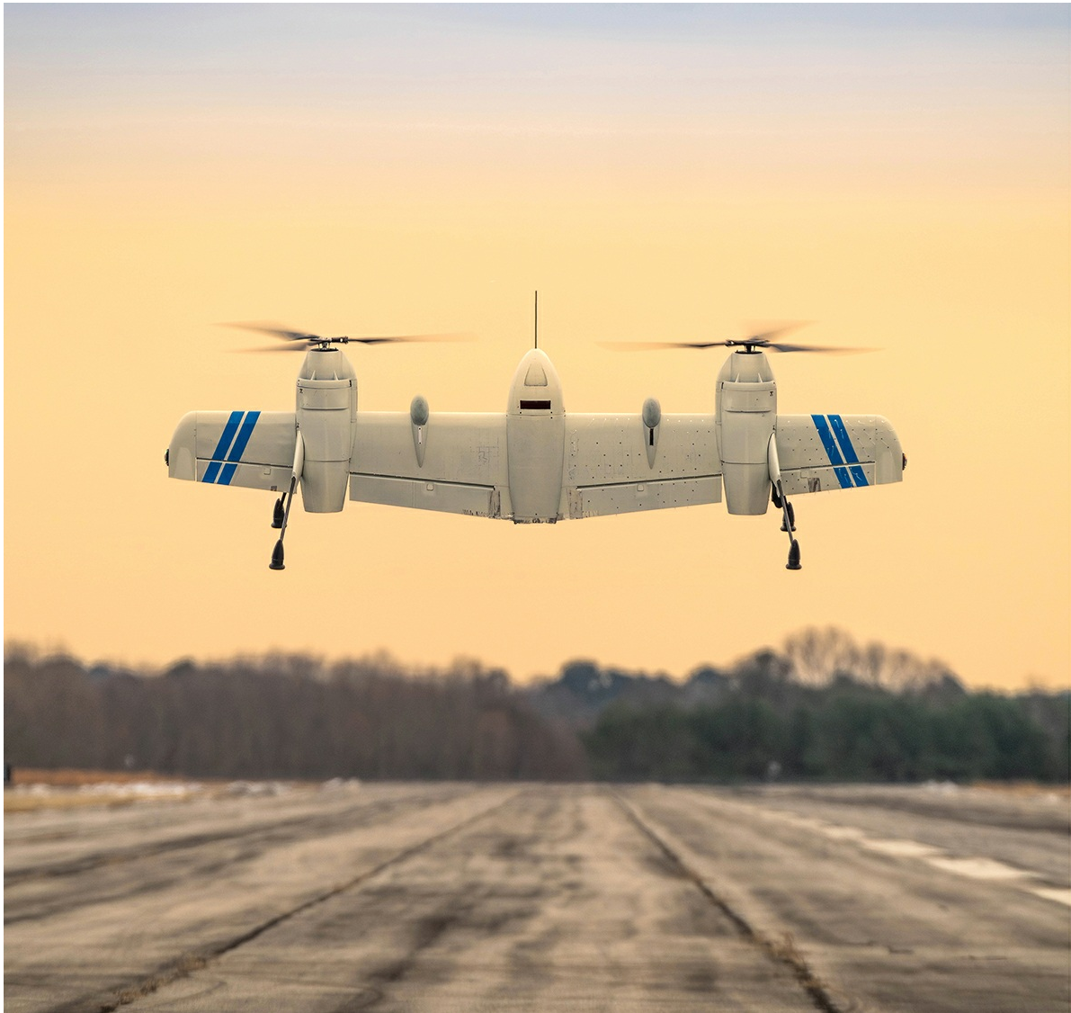
Sikorsky proves a rotor blown wing tail sitter drone can transition easily between helicopter and fixed wing flight modes.

Tail sitter drone can be scaled to larger sizes with hybrid-electric propulsion