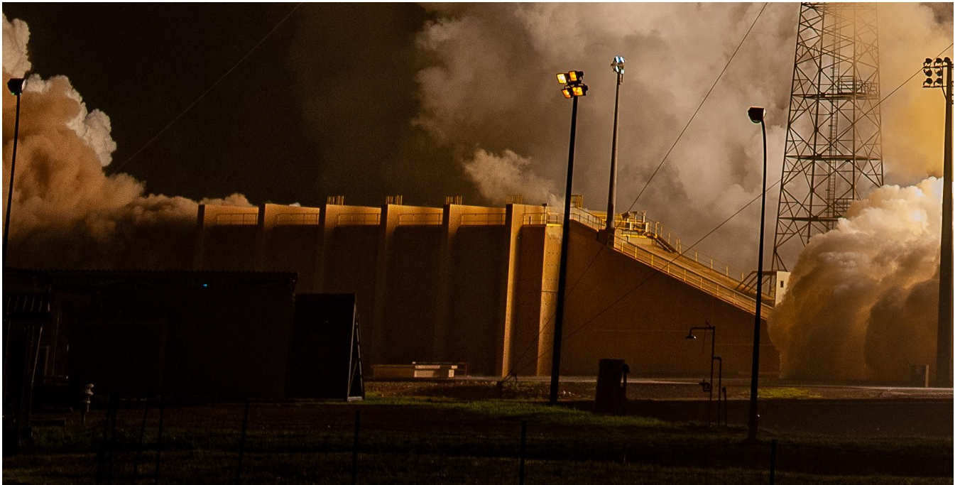
JCSAT-17 lifts off on an Ariane 5 rocket.

KOUROU, French Guiana, Feb. 18, 2020 /PRNewswire/ -- Lockheed Martin's (NYSE: LMT) third satellite based on the modernized LM 2100™ bus launched from the Guiana Space Center in French Guiana aboard an Ariane 5 rocket and is traveling to its transfer orbit for a series of in-orbit tests before operations are handed over to Sky Perfect JSAT Corporation (TYO: 9412). JCSAT-17 will provide flexible mobile communications services to users in Japan and the surrounding region.